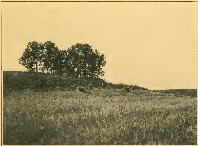
OLD FORT ON SIGNAL HILL